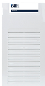
Sahara under-counter unit