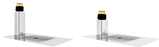
70mm & 120mm riser and font

NOTE: Finishes available varies by dispenser type.